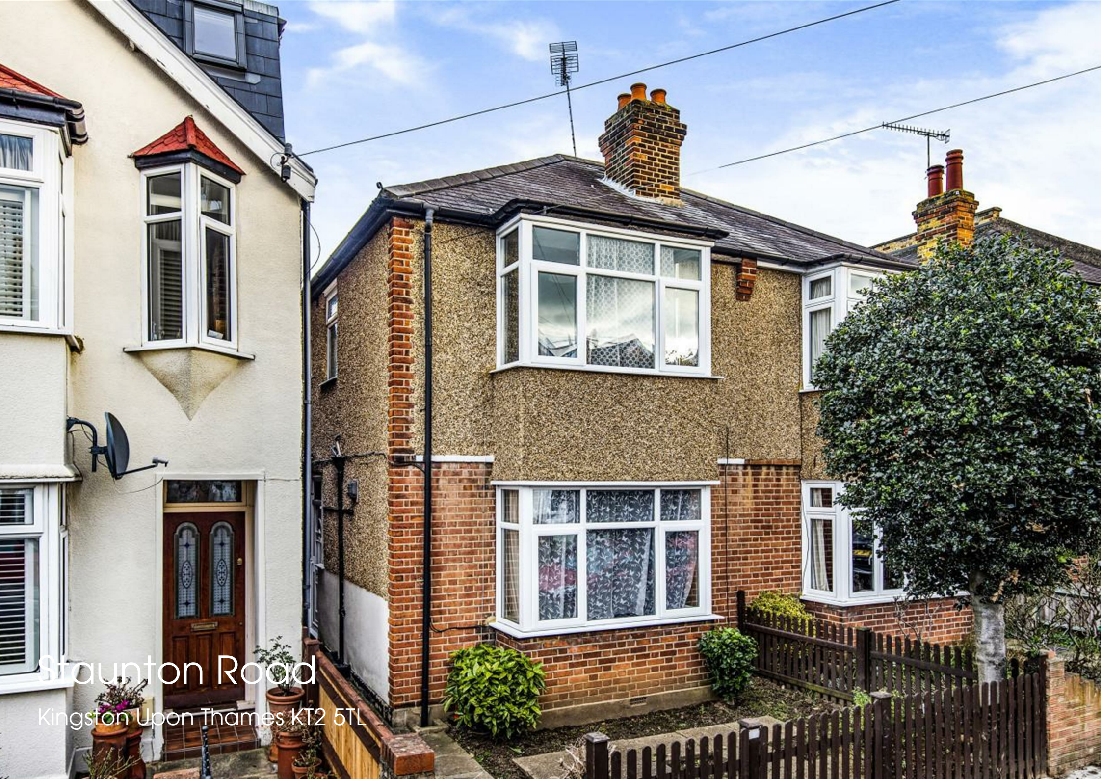
Staunton Road Kingston Upon Thames KT2 5TL

34 Richmond Road Kingston upon Thames Surrey KT2 5ED www.gibsonlane.co.uk Tel: 020 8546 5444